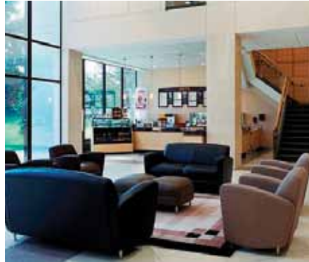
Metropoint 600, St. Louis Park, (Minneapolis) MN