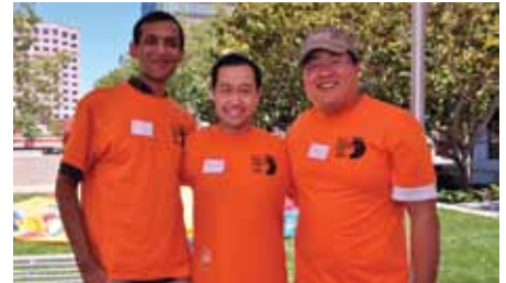
Kidney Walk Participants