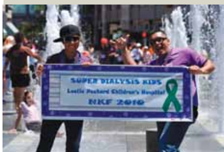
Kidney Walk Participants