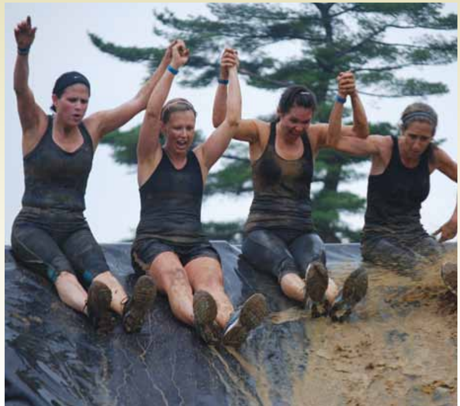
Mud Run Participants

The second annual run raised more than $825,000 for the National MS Society, a collective of passionate individuals who want to move together toward a world free of multiple sclerosis. The society's mission is to mobilize people and resources to drive research for a cure and to address the challenges of everyone affected by MS. Presently, there are more than 400,000 Americans living with MS. For more information on the Society, please visit www.nationalmssociety.org ■