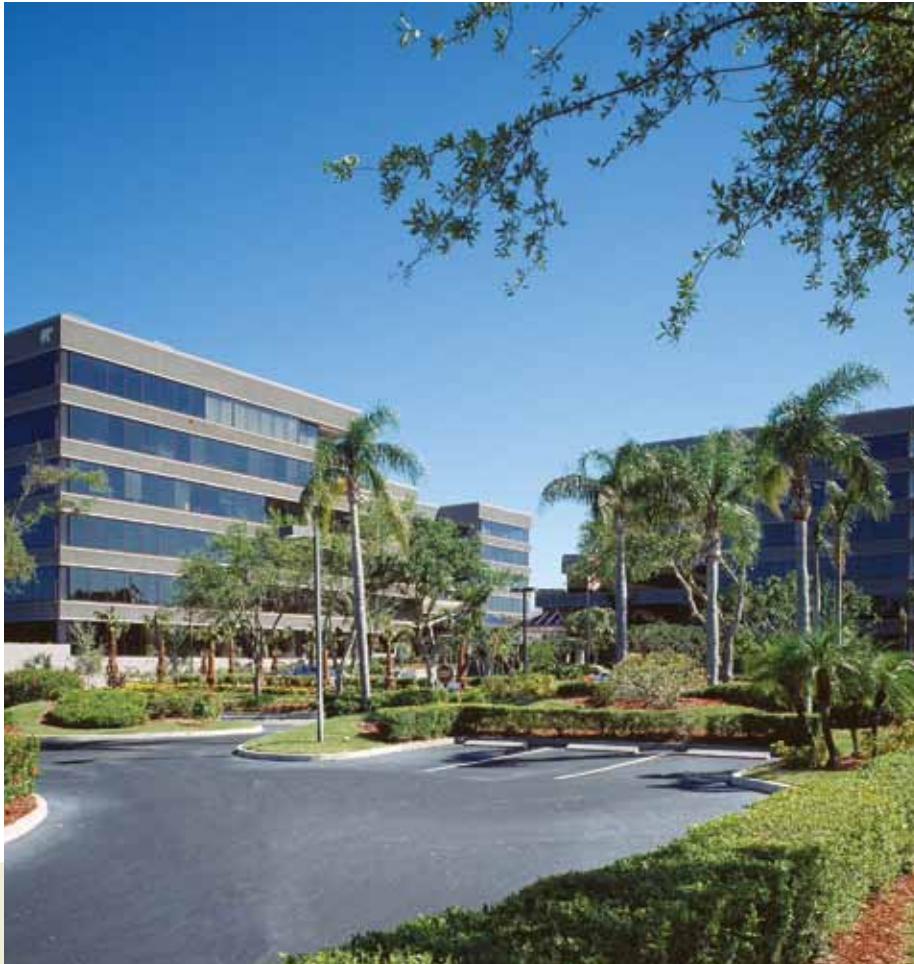
Golden Bear Plaza, Palm Beach Gardens, FL