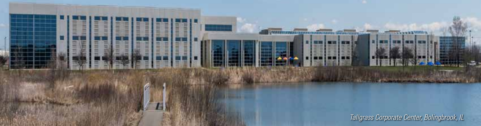
Tallgrass Corporate Center, Bolingbrook, IL