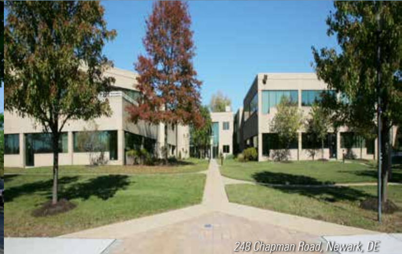
248 Chapman Road, Newark, DE