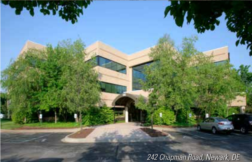
242 Chapman Road, Newark, DE