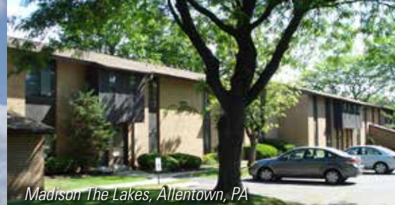
Madison The Lakes, Allentown, PA