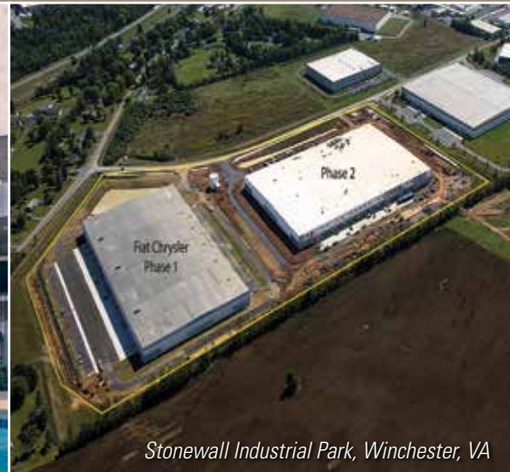
Stonewall Industrial Park, Winchester, VA