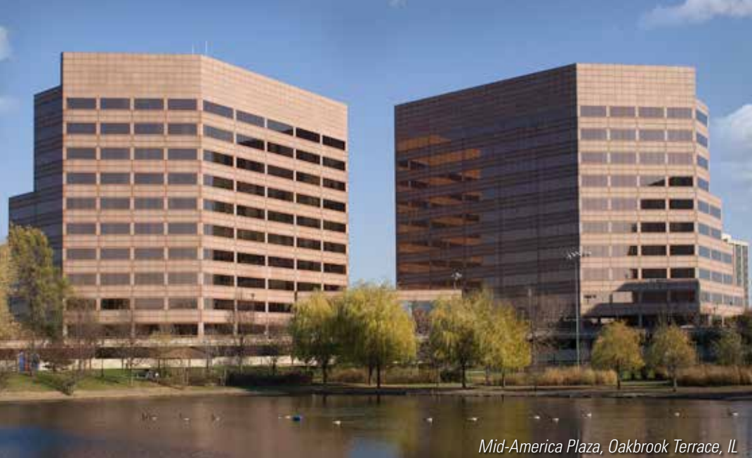
Mid-America Plaza, Oakbrook Terrace, IL